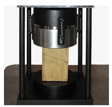
Figure 105: Compression test

• Compression test: This test involves applying forces towards each other at the sides of a material. This may lead to the material crushing and so a universal test machine is used to determine the compression strength. It is basically, how long a material can take before it gets crushed.