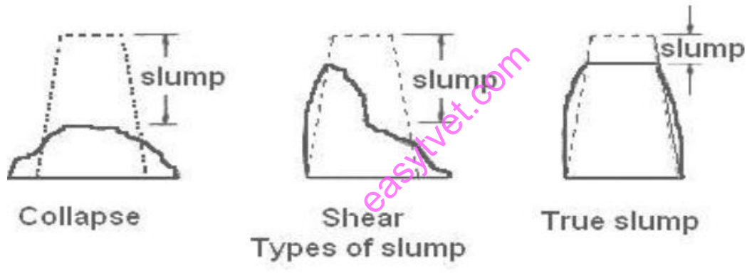
Figure 103: Slump test

Slump test is used to measure the wetness of concrete. It is mainly done to confirm workability of concrete. A slump can be true slump, collapse and shear slump as shown below.